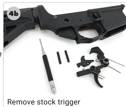
Remove stock trigger