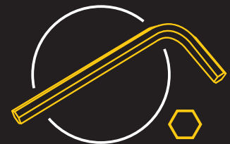
Flat head or hex key to remove pistol grip